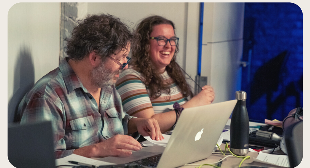
STUDIO WEEKS 2022 INTERNATIONAL

Company members from Chile, Australia & the US travelled to Bangalore, India for two weeks to collaborate with local artists.